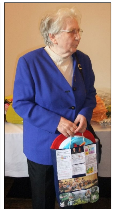
Lower part: Photos from Puchberg